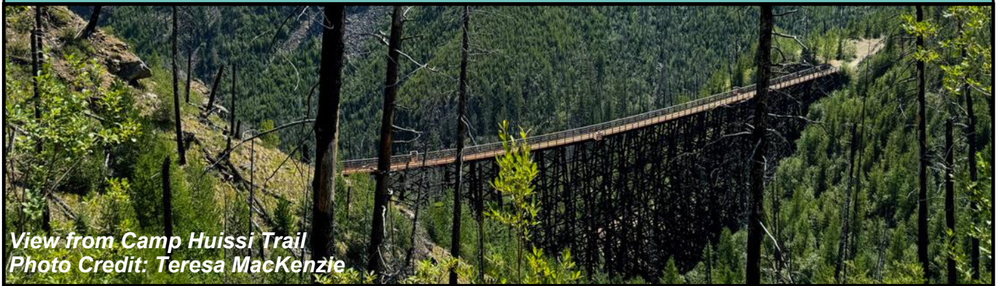
View from Camp Huissi Trail

Box 28011 RPO East Kelowna, Kelowna BC V1W 4A6 http://www.foss-kelowna.org info@foss-kelowna.org