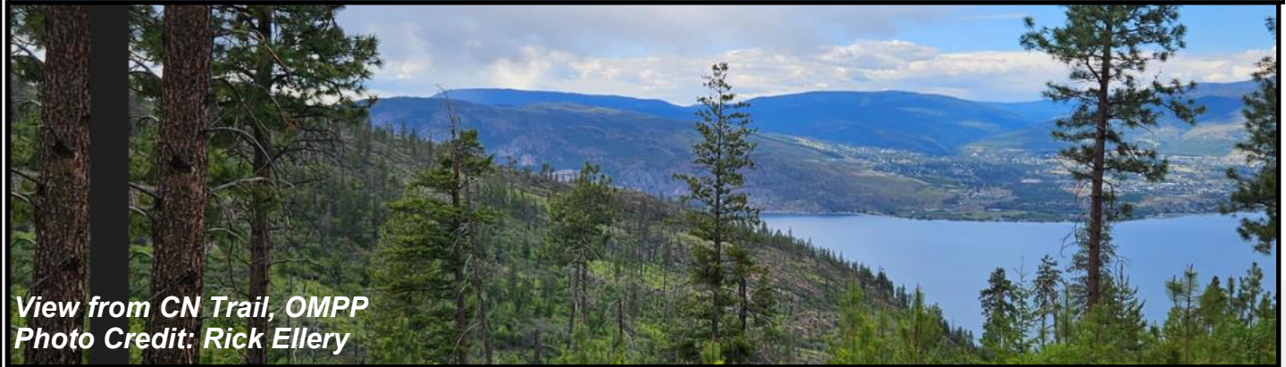
View from CN Trail, OMPP

Box 28011 RPO East Kelowna, Kelowna BC V1W 4A6 http://www.foss-kelowna.org info@foss-kelowna.org