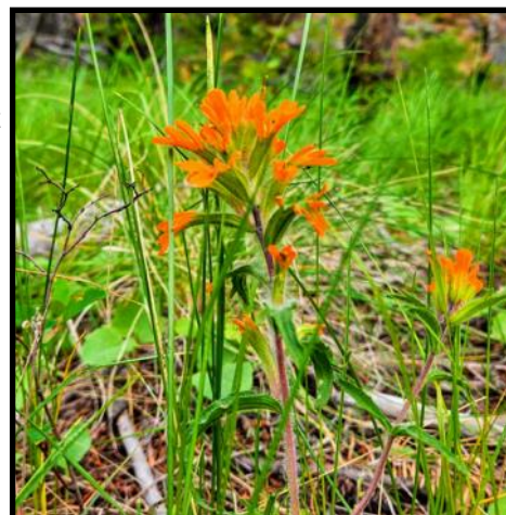
Indian Paintbrush on Fairlane Trail, MBPP

Going in to summer, FOSS will shift its equipment to the KVR to do rail trail bed maintenance and work on upper Myra Bailout Trail.