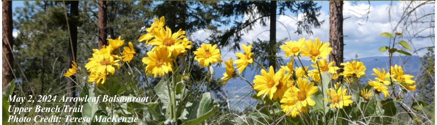
May 2, 2024 Arrowleaf Balsamroot Upper Bench Trail

Box 28011 RPO East Kelowna, Kelowna BC V1W 4A6