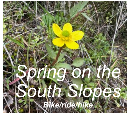
Sagebrush Buttercup