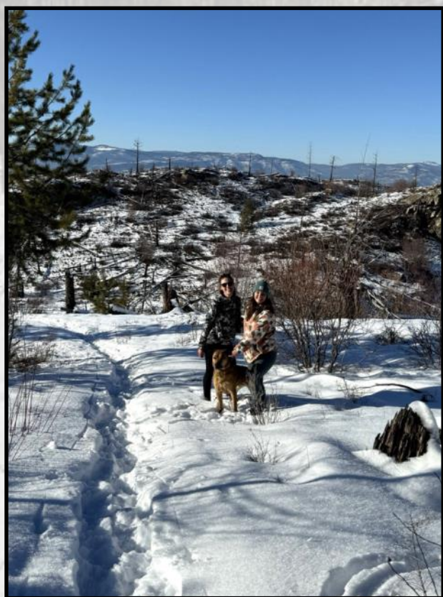
February, 2024—Hikers on Moose Trail & a rider on Galloping Trail (Myra-Bellevue)