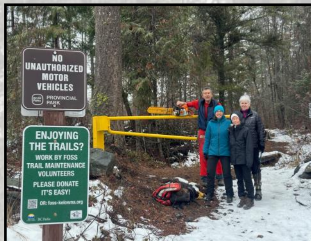
January, 2024—Trail maintenance on upper Myra Bailout Trail