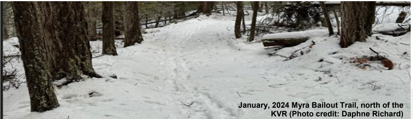
January, 2024 Myra Bailout Trail, north of the KVR

Box 28011 RPO East Kelowna, Kelowna BC V1W 4A6