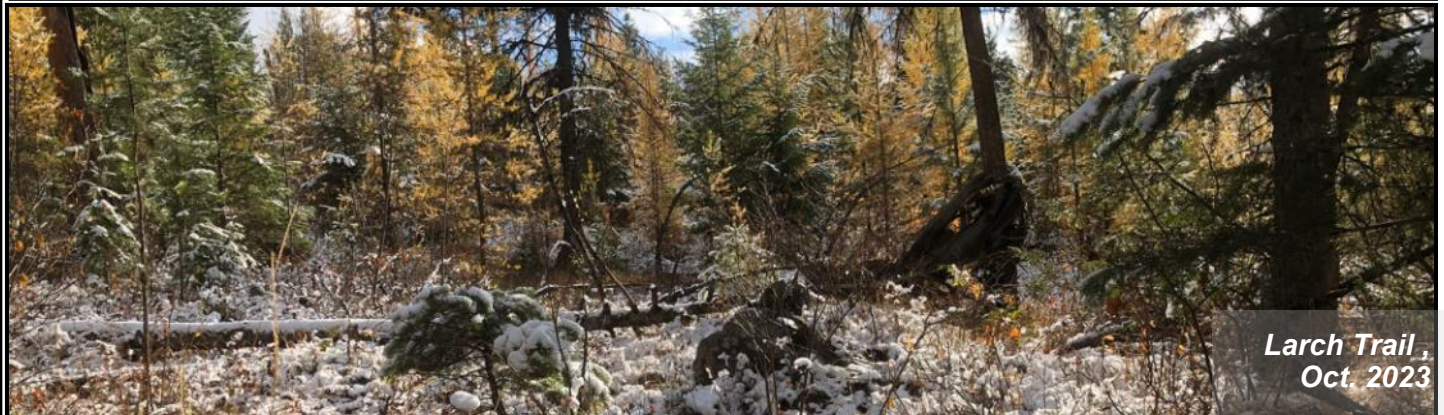
Larch Trail, Oct. 2023

Box 28011 RPO East Kelowna, Kelowna BC V1W 4A6