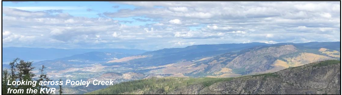
Looking across Pooley Creek from the KVR

Box 28011 RPO East Kelowna, Kelowna BC V1W 4A6