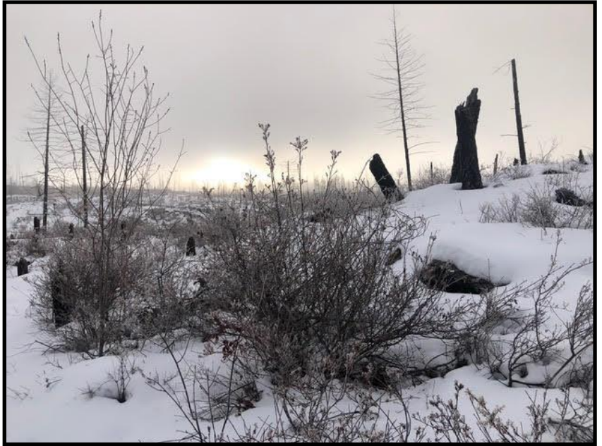
A foggy winter's day on Earring Trail

2021 Adopt-a-Trail (AAT) Sponsors and Volunteers accomplished a wide array of great trail maintenance projects totaling 564 work hours in Myra Bellevue and Okanagan Mountain Park areas. The FOSS Adopt-a-Trail committee continues to support and facilitate wherever possible. Please contact FOSS if you have any suggestions or would like any assistance from the FOSS Trail Crew.