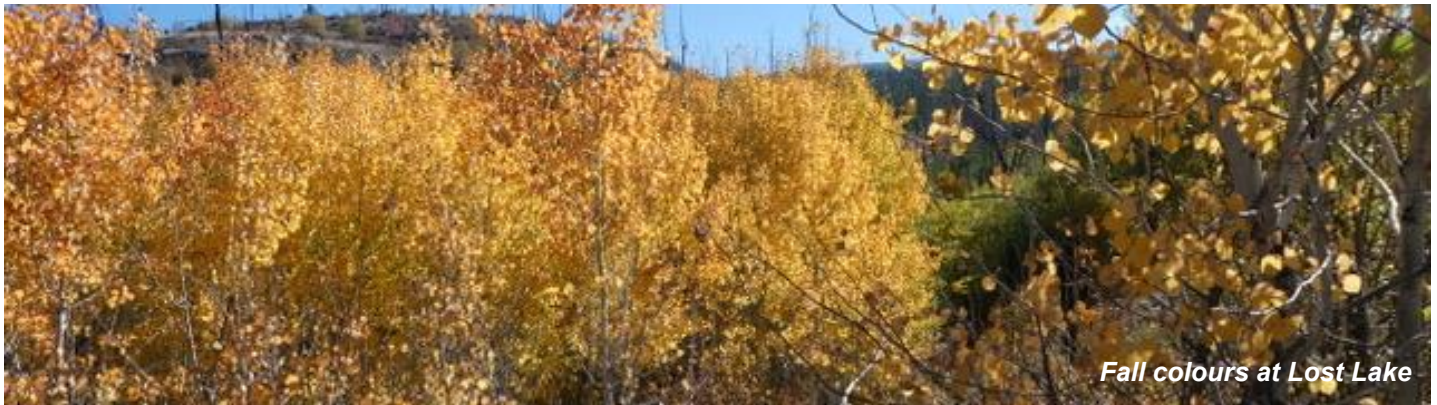
Fall colours at Lost Lake

Box 28011 RPO East Kelowna, Kelowna BC V1W 4A6