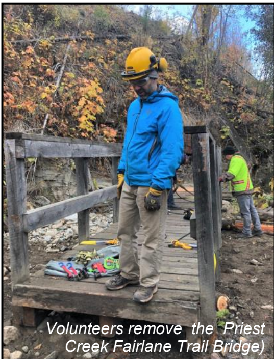
Volunteers remove the Priest Creek Fairlane Trail Bridge)