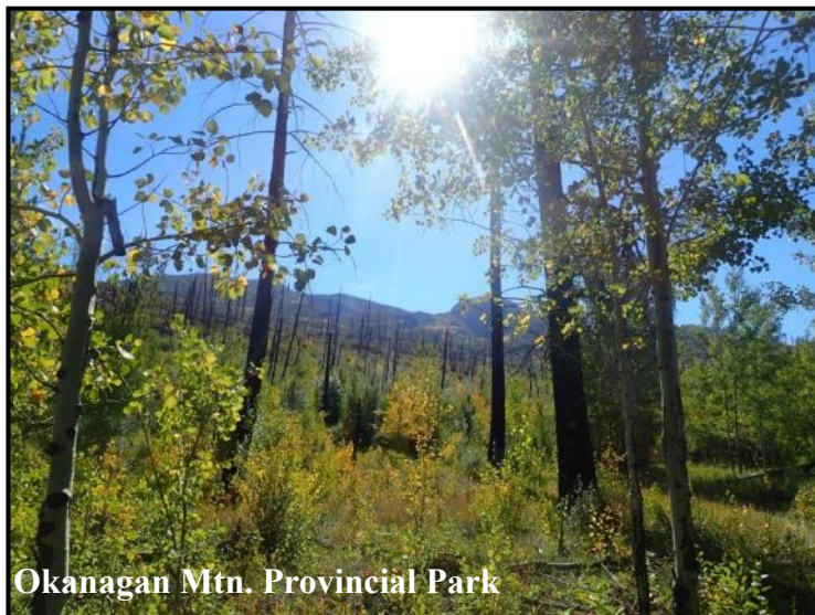
Okanagan Mtn. Provincial Park