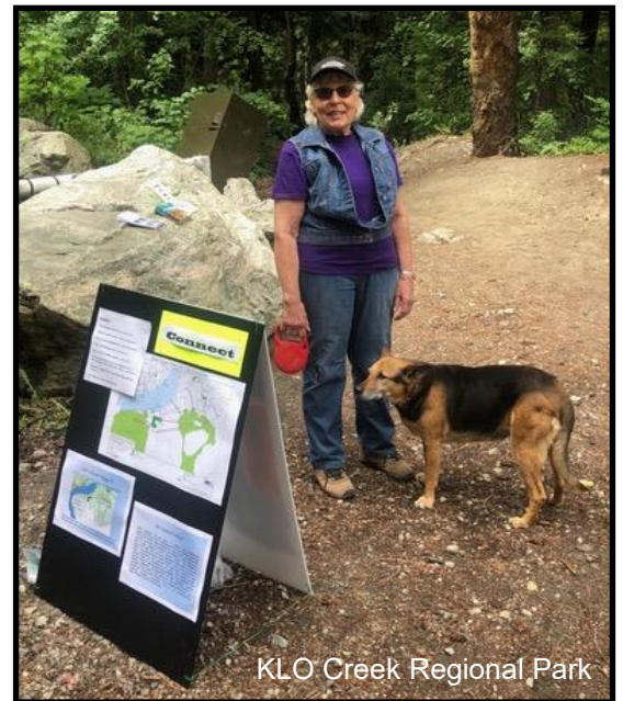
KLO Creek Regional Park

FOSS Directors set up information tables at four locations—Stewart Rd. East Trailhead in Myra-Bellevue, the north parking lot in Okanagan Mtn. Provincial Park, KMRA Trails (south end of Field Rd.) and KLO Creek Regional Park. Volunteers shared FOSS' vision of a South Slopes Greenbelt — pathways & trails connecting the Okanagan Rail Trail in Kelowna through to Okanagan Mtn. Provincial Park & Naramata. Directors will host another 'Meet & Greet' this summer.