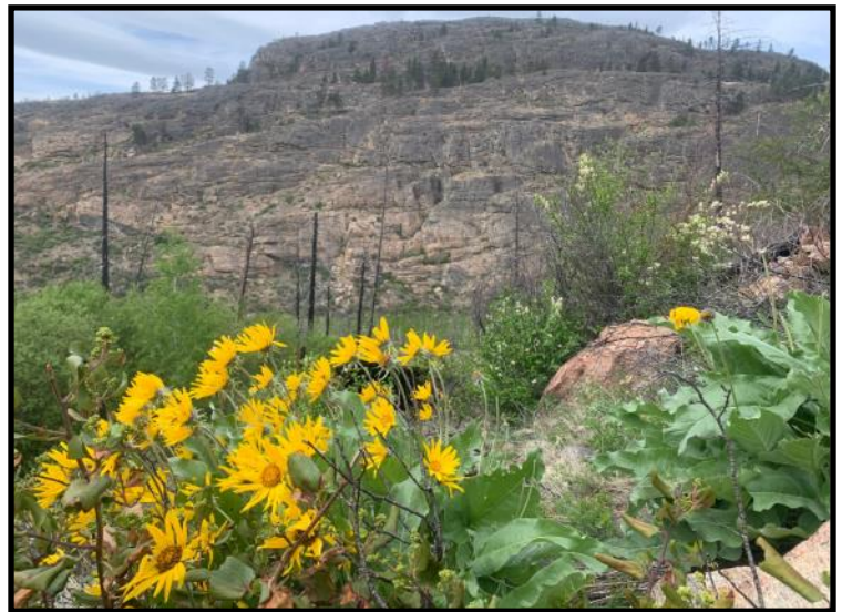
May 3, 2021—Wildhorse Canyon Trail, OMPP (Alan Milnes)

Jonathan was receptive to FOSS' plans to camp at Buchan Bay in October and do a good brushing of Wildhorse Canyon Trail. Approval of the land acquisition at the Golden Mile is almost complete from a management point of view—great news from FOSS' perspective as it means the improvements can be made at the Golden Mile/Lakeshore Rd. junction, and FOSS can then access the north end of the Wild Horse Canyon trail and do some much needed brushing.