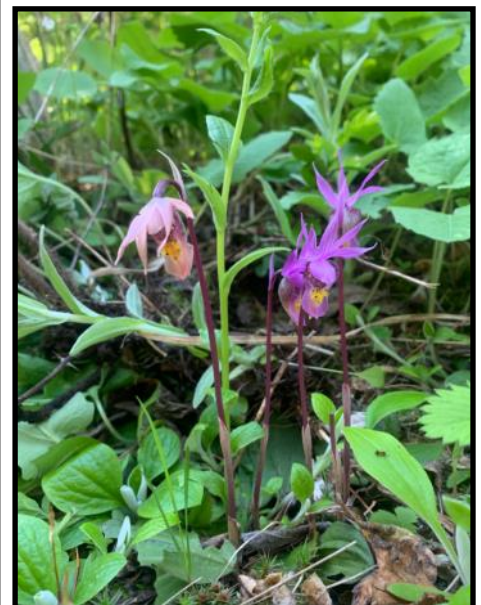
May 23, 2021 Sticky Current & Calypso Orchids, Outhouse Tr. (MBPP) (Milnes)