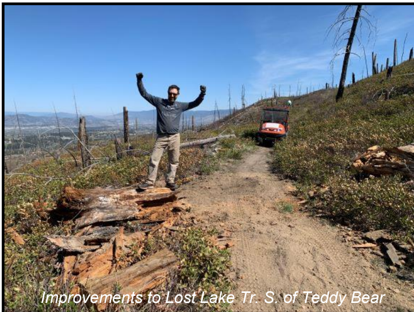
Improvements to Lost Lake Tr. S. of Teddy Bear