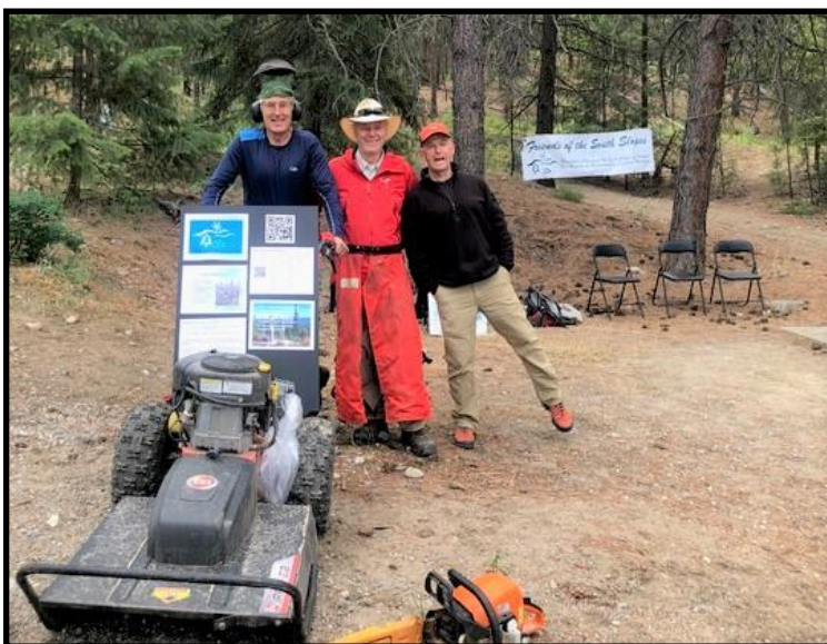
SRE Trailhead, Myra-Bellevue Provincial Park