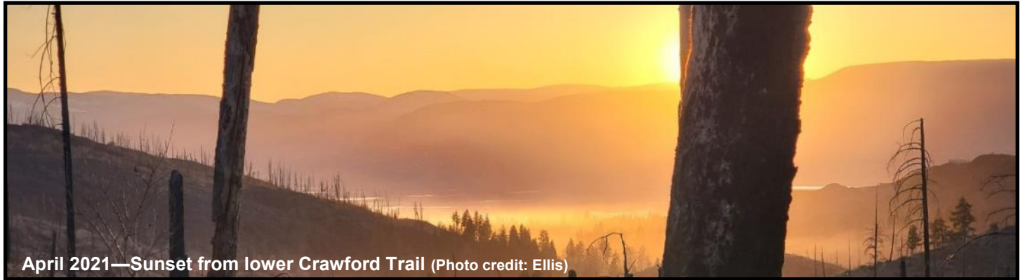
April 2021—Sunset from lower Crawford Trail

Box 28011 RPO East Kelowna, Kelowna BC V1W 4A6