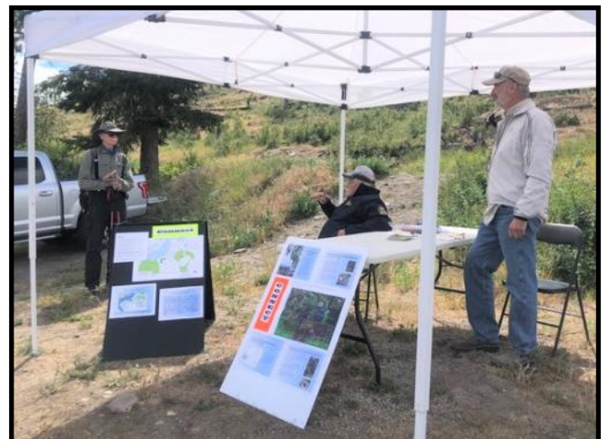
Okanagan Mtn. Provincial Park