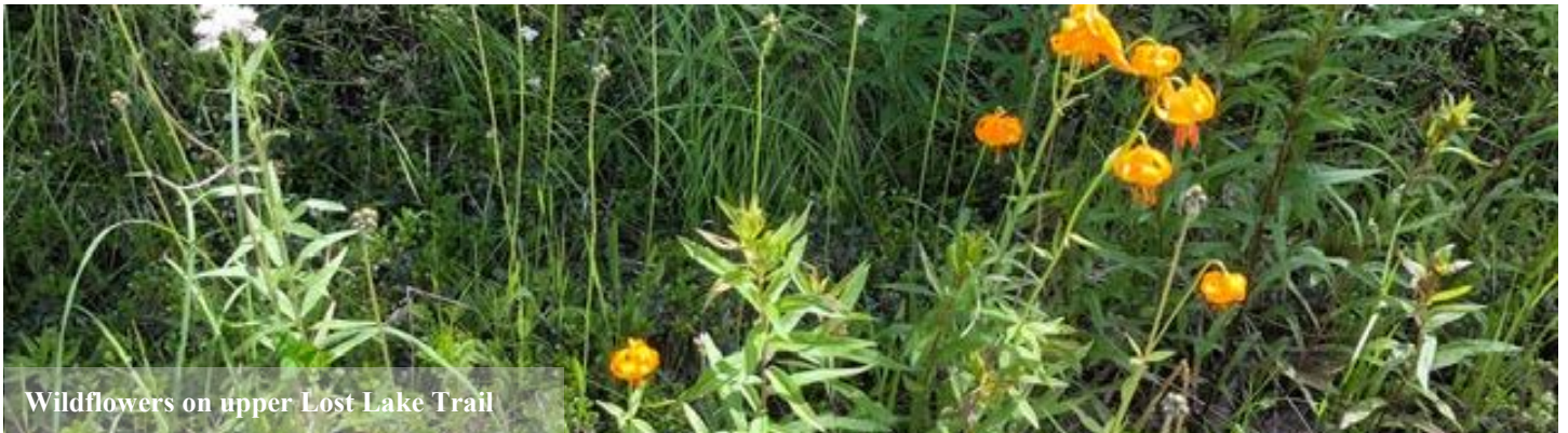
Wildflowers on upper Lost Lake Trail

Box 28011 RPO East Kelowna, Kelowna BC V1W 4A6 http://www.foss-kelowna.org info@foss-kelowna.org