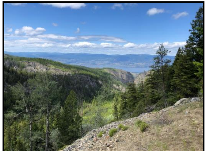
Bellevue Canyon, from the KVR

And then there's the cycle from Little White FSR to Bellevue Trestle—(photo on the right), more spectacular views! For all three of these adventures, you may be sharing the trail with motorized vehicles, ATV & dirt bikes as motorized recreation is permitted.