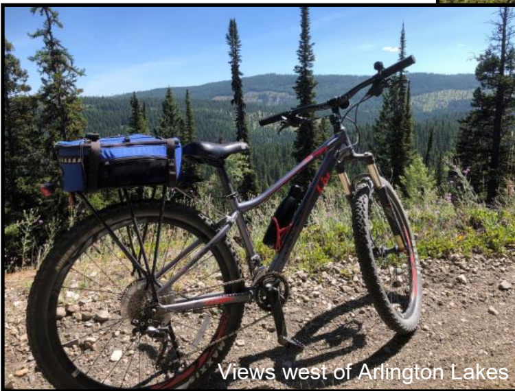
Views west of Arlington Lakes

And then there's the cycle from Little White FSR to Bellevue Trestle—(photo on the right), more spectacular views! For all three of these adventures, you may be sharing the trail with motorized vehicles, ATV & dirt bikes as motorized recreation is permitted.