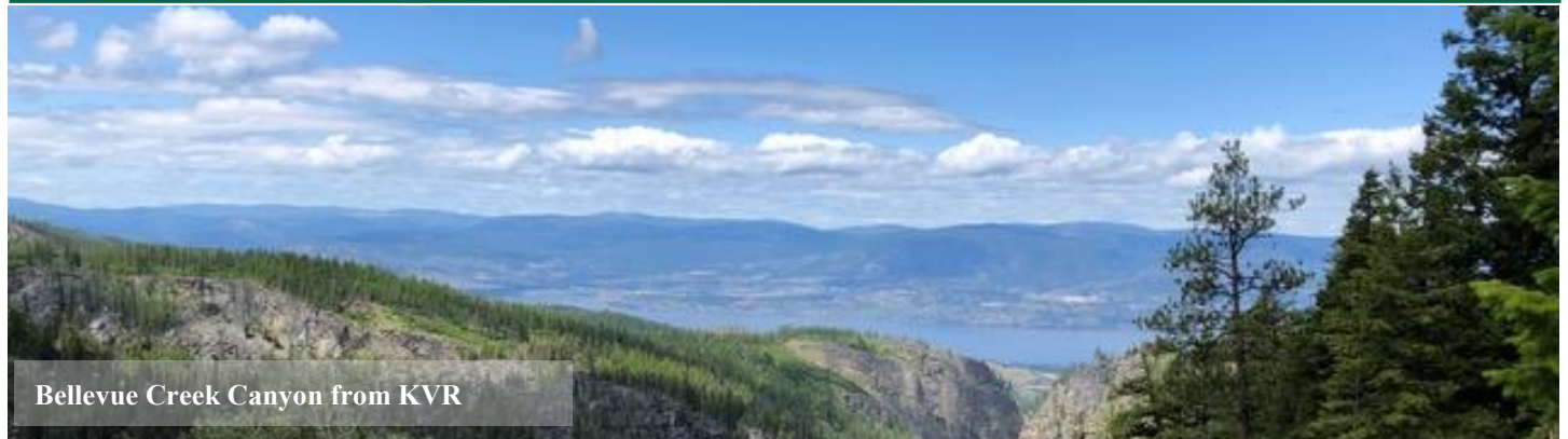
Bellevue Creek Canyon from KVR

Box 28011 RPO East Kelowna, Kelowna BC V1W 4A6 http://www.foss-kelowna.org info@foss-kelowna.org