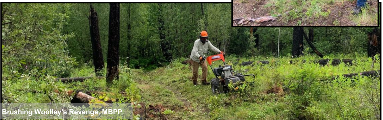
Brushing Woolley's Revenge, MBPP