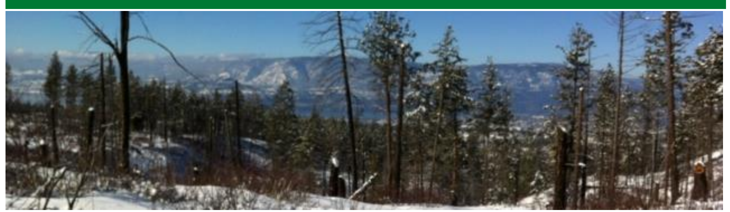
Box 28011 RPO East Kelowna, Kelowna BC V1W 4A6 <a href="http://www.foss-kelowna.org">http://www.foss-kelowna.org</a>