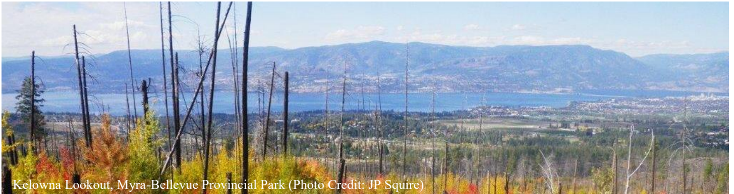
Kelowna Lookout, Myra-Bellevue Provincial Park

Box 28011 RPO East Kelowna, Kelowna BC V1W 4A6