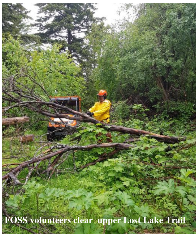
FOSS volunteers clear upper Lost Lake Trail

BEAR ALERT!! It's that time of the year—lots of bear scat and sightings in Myra-Bellevue Park.