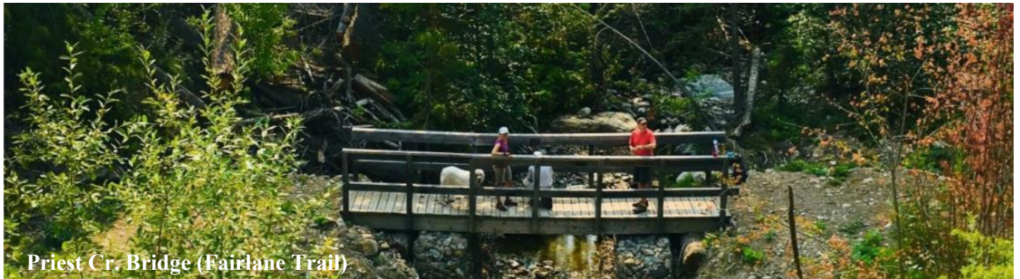
Priest Cr. Bridge (Fairlane Trail)

Box 28011 RPO East Kelowna, Kelowna BC V1W 4A6