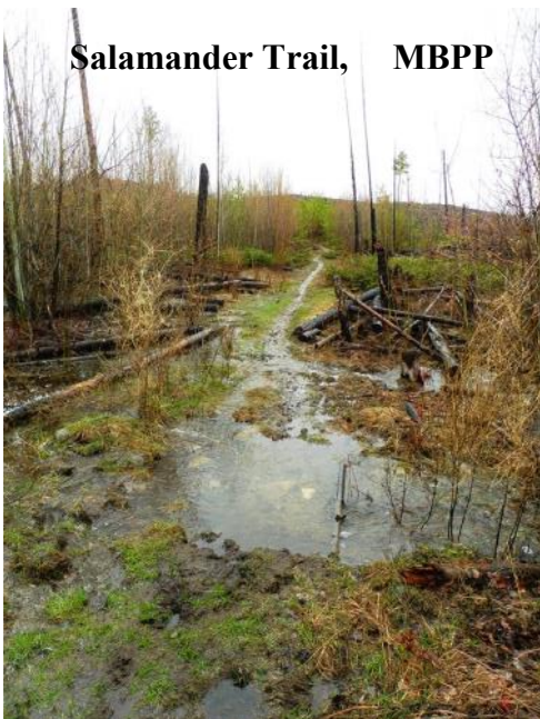
Salamander Trail, MBPP

From one of our 'fans': "As a year-round trail user in MBPP, I want you to know how much I appreciate all the trail improvement projects supported by the FOSS Board, by the Adopt-a-Trail volunteers, and by those contractors employed by FOSS." We would like to also mention those hikers, cyclists, equestrians, runners etc. who may not be FOSS members but who still contribute in such a big way to clearing and improving our trails.