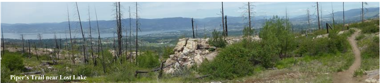
Piper's Trail near Lost Lake