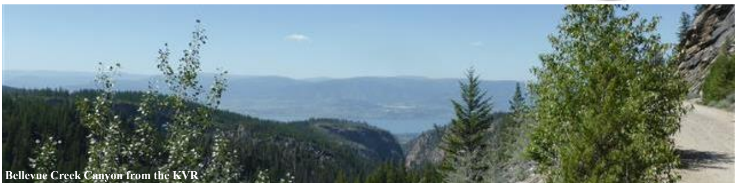
Bellevue Creek Canyon from the KVR