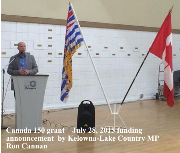
Canada 150 grant—July 28, 2015 funding announcement by Kelowna-Lake Country MP Ron Cannan

In late July, the FOSS board was notified that it's application for a Canada 150 grant was successful. This $20,000 federal grant (Western Economic Diversification Canada WEDC) is for infrastructure upgrades. FOSS will be applying these funds to repair/replace bridges in Myra-Bellevue and to continue with its ongoing trail restoration projects. As with FOSS' 2015 National Trails Coalition grant, the Canada 150 grant requires matching funds to fully leverage the federal money. In the case of the Canada 150 grant, FOSS must provide WEDC with proof of paid invoices up to $40,000 before the federal funding of $20,000 is released. Looks like more fund raising is in store for FOSS in 2016!