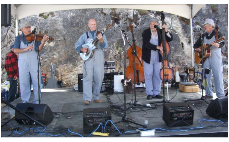
The Kettle Valley Brakemen playing at the re-opening of the Myra Canyon Trestles on June 22, 2008

Tickets are $10 for adults, $5 for children and $25 for a family.