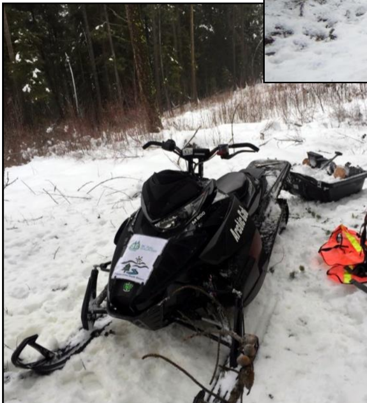
Dale Letkeman out on a trail grooming excursion.