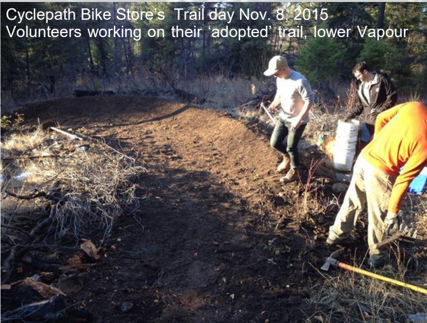
Cyclepath Bike Store's Trail day Nov. 8, 2015 Volunteers working on their 'adopted' trail, lower Vapour

If you want to learn more about the Okanagan-Shuswap LRMP, you can read the 826 page document: https://www.for.gov.bc.ca/tasb/slrp/lrmp/kamloops/okanagan/plan/files/oslrmpfull.pdf