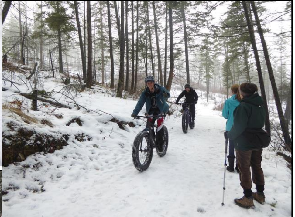
"Fat Bikes" and hikers on Lost Lake Trail.