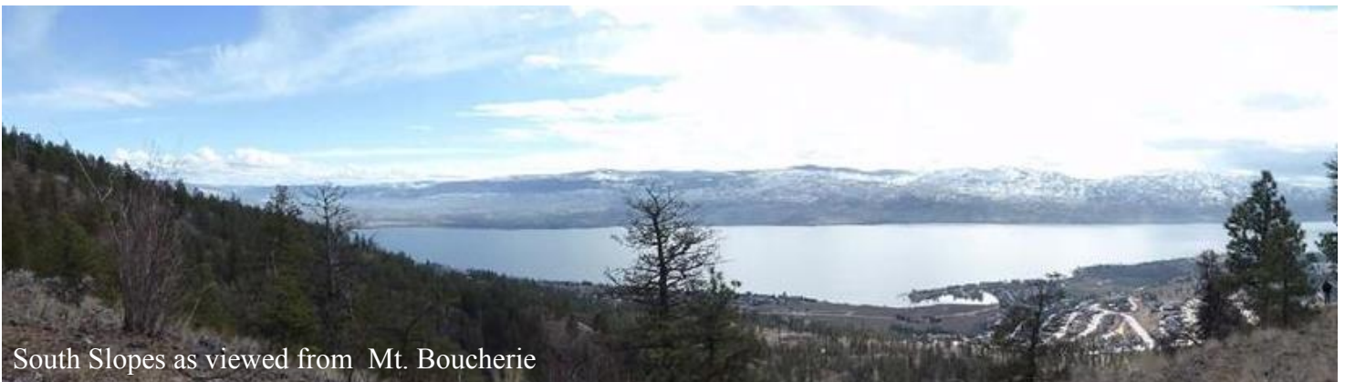
South Slopes as viewed from Mt. Boucherie