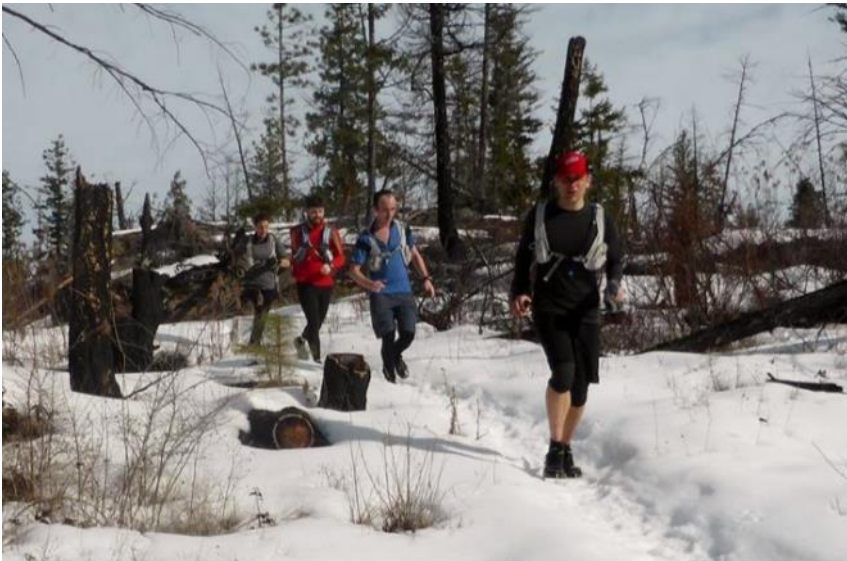
Trail runners on Fairlane Trail—March 2014

The current project involves Myra-Bellevue Provincial Park but the long term goal is to have a comprehensive First Responder Plan for the South Slopes from Myra Canyon to Okanagan Mtn. Provincial Park.