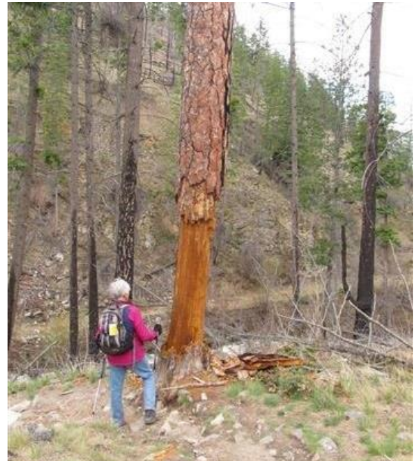
Keep walking! Hazard tree on Boulder Trail in Ok. Mtn. Prov. Park (bear claw marks on the tree trunk too! )