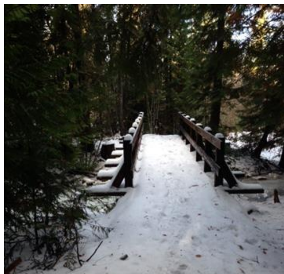
Priest Creek Trail