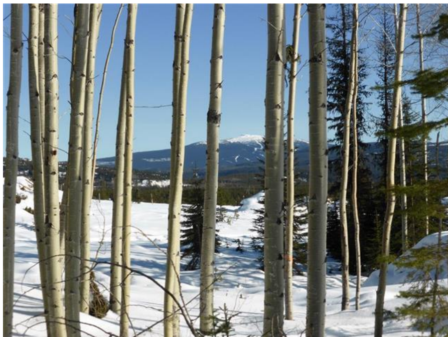
Big White Mtn. as seen from Log Cabin Trail, Nordic Ski area, McCulloch Lk.