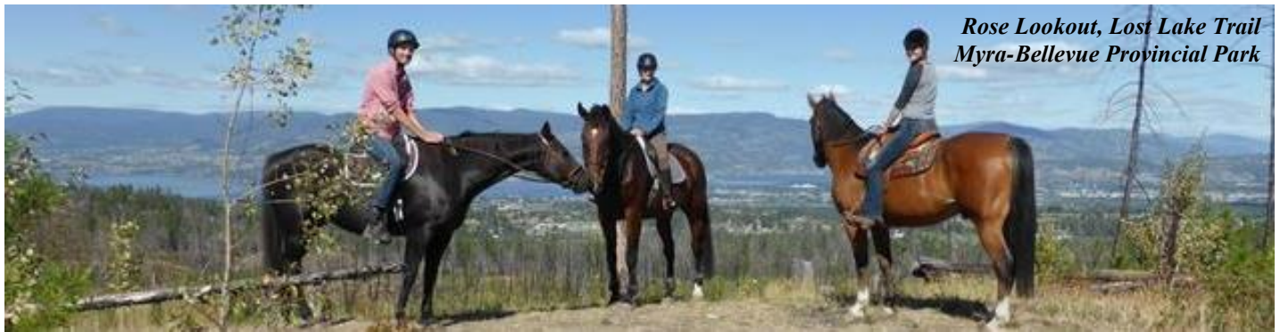
Rose Lookout, Lost Lake Trail Myra-Bellevue Provincial Park

Box 28011 RPO East Kelowna Kelowna BC V1W 4A6