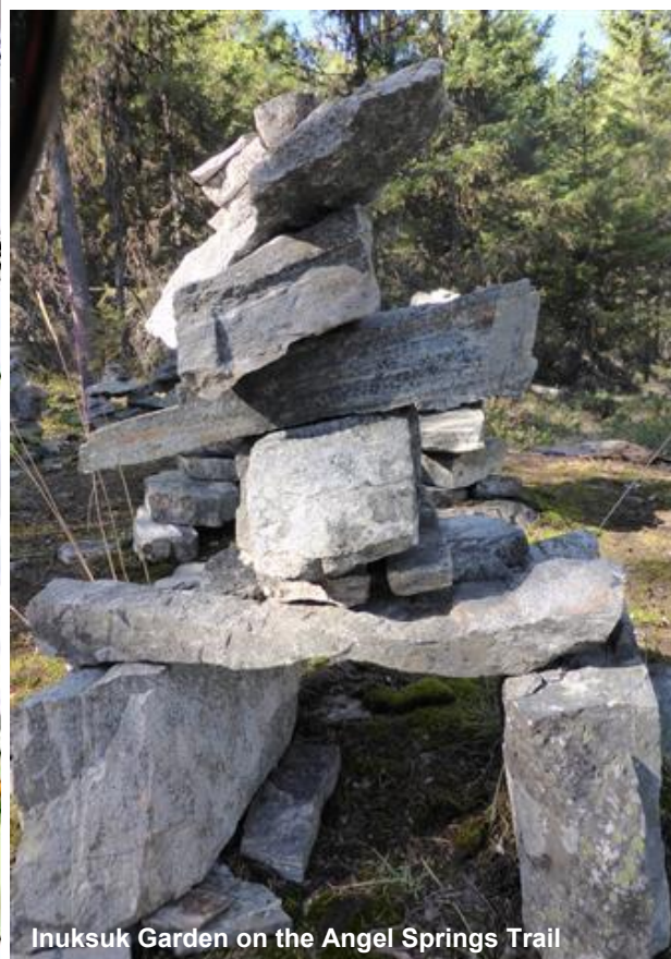
Inuksuk Garden on the Angel Springs Trail