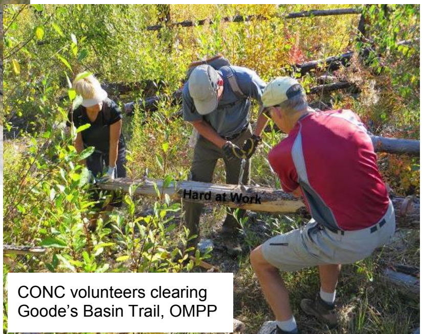
CONC volunteers clearing Goode's Basin Trail, OMPP