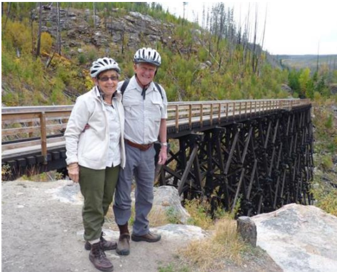
Visitors from Brisbane, Australia enjoy a beautiful fall day cycling the Myra Canyon Trail

Boulder/Wild Horse are the only trails in OMPP that are part of the PFO's contract. The Central Okanagan Naturalists Club (CONC) will continue to maintain Goode's Basin Trail as part of FOSS' Adopt a Trail program and BC Parks' staff will clear Mt. Goat Trail & CN Trail.