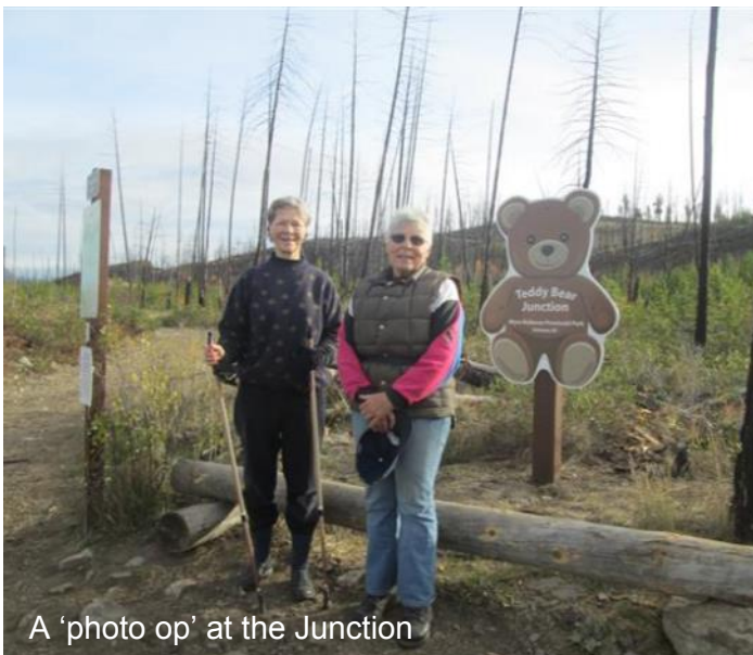
A 'photo op' at the Junction