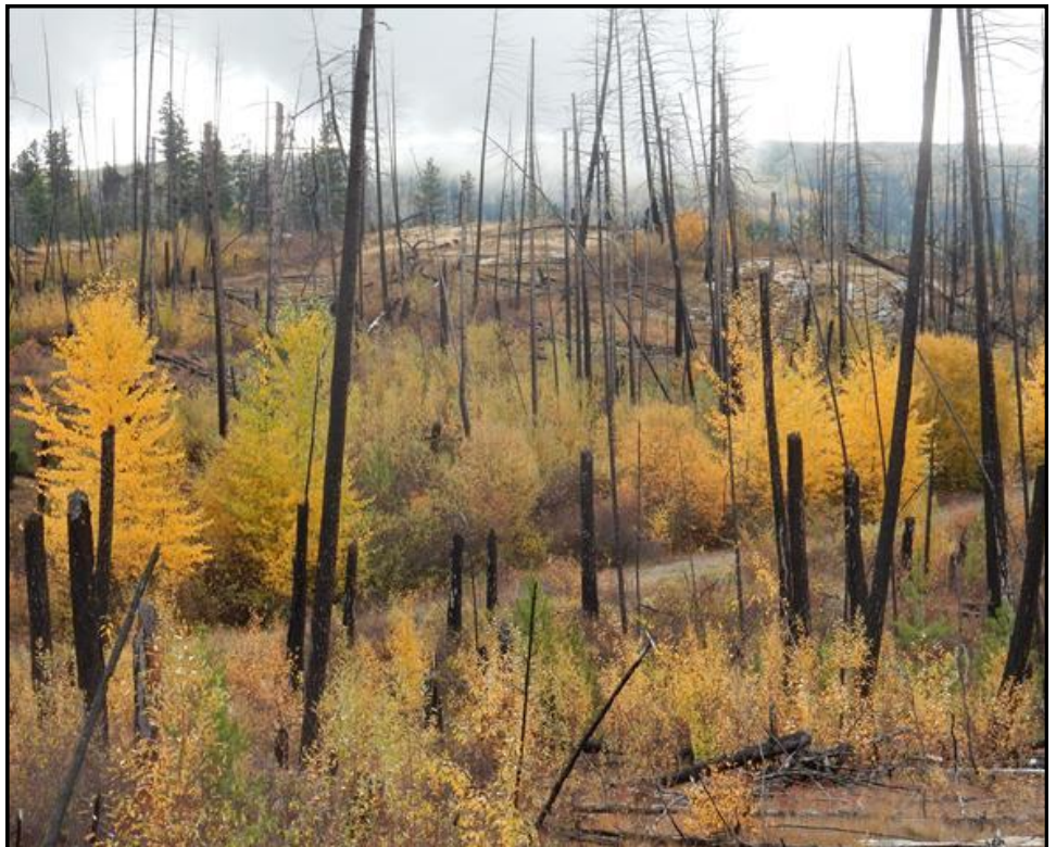
View from Myra Bailout Trail, looking at Hromek