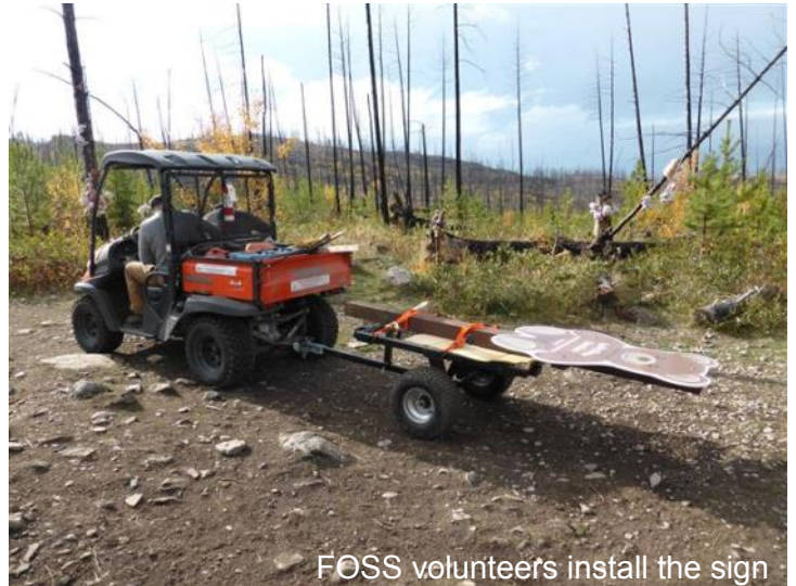
FOSS volunteers install the sign

A new Teddy bear is now in residence at Teddy Bear Junction in Myra-Bellevue Provincial Park. We hope that our bear sign will be a popular place for photo-ops and a destination to which families will hike, bike or ride. FOSS would love to see your photos posted on our Facebook page, FOSS-Kelowna.