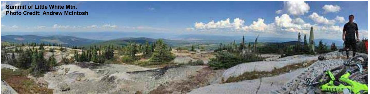
Summit of Little White Mtn.

Box 28011 RPO East Kelowna Kelowna BC V1W 4A6