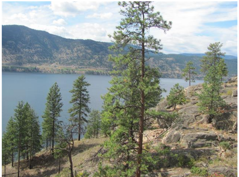
View from Buchan Bay Trail, Okanagan Mtn. Provincial Park

FOSS is developing an erosion mitigation project for OMPP with funding shared between FOSS, BC Parks and the Okanagan Similkameen Parks Society.