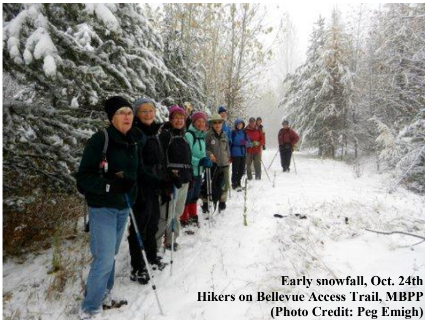
Early snowfall, Oct. 24th Hikers on Bellevue Access Trail, MBPP