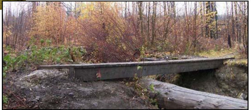
Above: Oct. 27, 2012 Lost Lake Loop Bridge

Up until the advent of the iPad, Flash sites were favoured by web designers. However, when Apple introduced the iPad and iPhone Apple decided that they wouldn't allow the Flash Player in their mobile iOS operating system. This has created a dilemma as internet users cannot access the FOSS website from their iPhones or iPads. David is currently rebuilding the FOSS site into a "responsive site" that will be able to configure its design to whatever device or operating system a person is using. This requires a lot of time — and FOSS is most appreciative of David's efforts. In the meantime, if you are trying to access the FOSS website using your iPhone or iPad, you will get an "under construction" message.