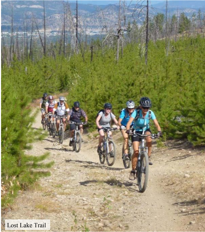
Lost Lake Trail