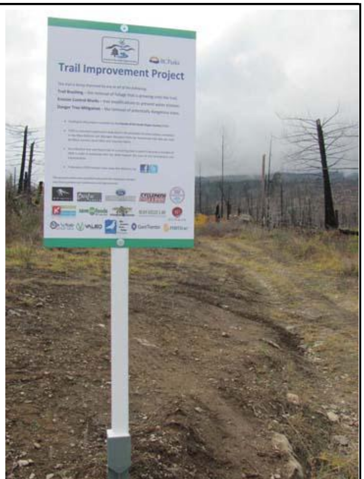
FOSS sign erected at trail improvement projects. Above: Crawford Trail

For more information about its year round programs and exhibits visit regionaldistrict.com/parks .