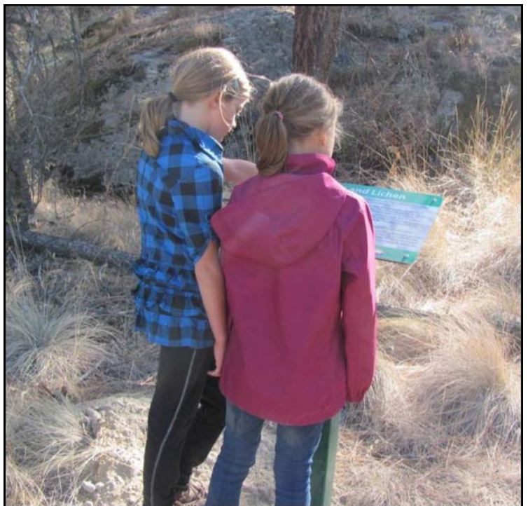
One of the interpretive signs near SRE Trailhead

Thanks to our volunteers, many trails in Myra-Bellevue and Okanagan Mountain Provincial Parks were cleared, brushed and improved over the summer. These volunteers either worked under FOSS' Adopt a Trail program or on other trail maintenance work parties.