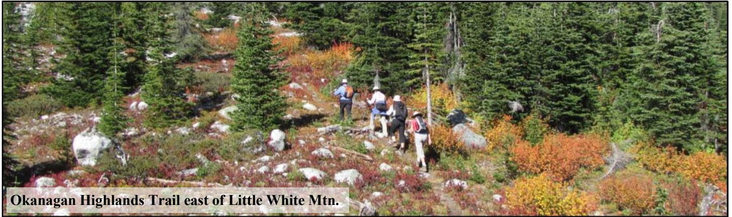
Okanagan Highlands Trail east of Little White Mtn.