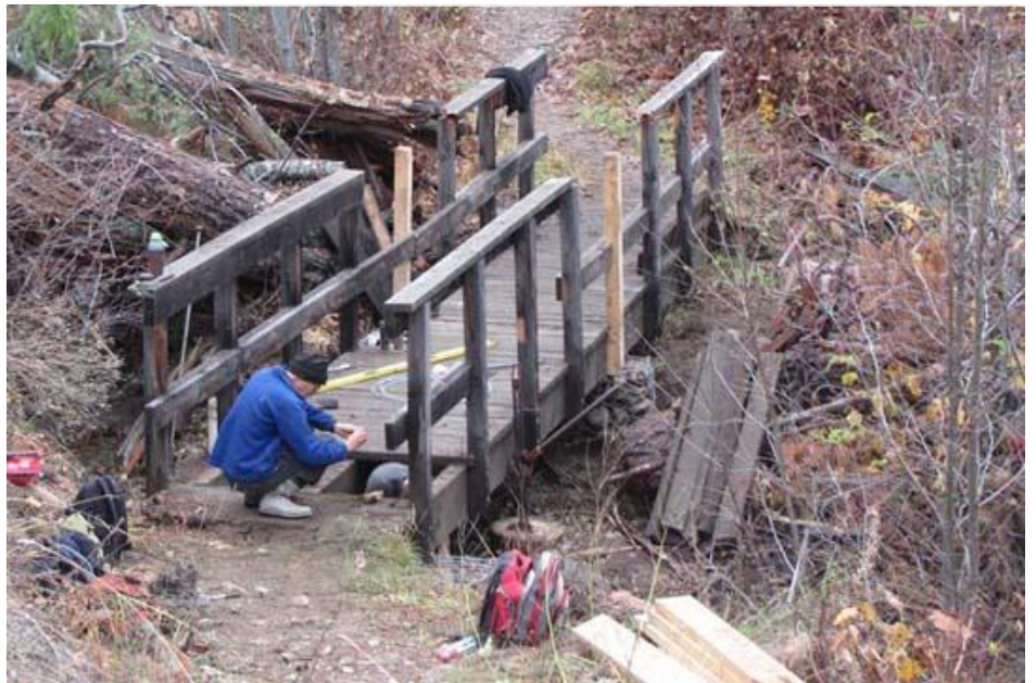
Above: Nov. 6, 2012 BC Parks' contractor repairing the bridge on Fairlane Trail