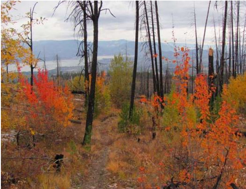
Fall colours on Hillbilly Trail, MBPP