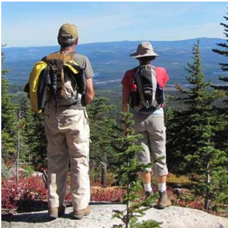
Okanagan Highlands Trail east of Little White Mtn.