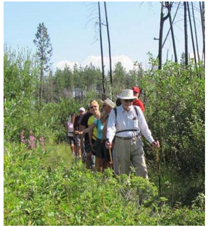
Hikers from the Water Street Seniors Center On Salamander Trail, MBPP