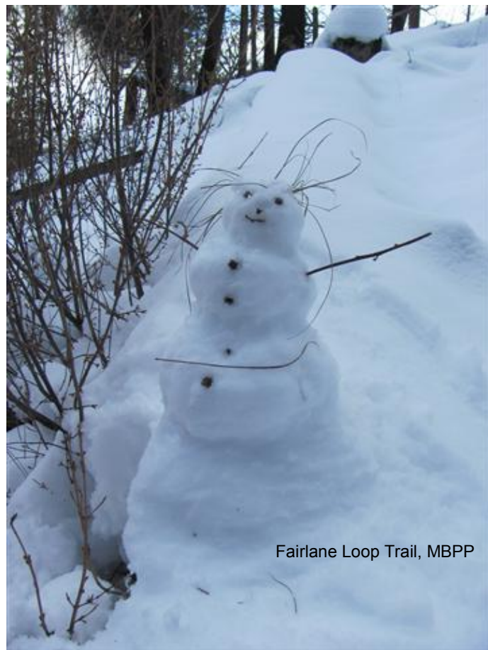
Fairlane Loop Trail, MBPP