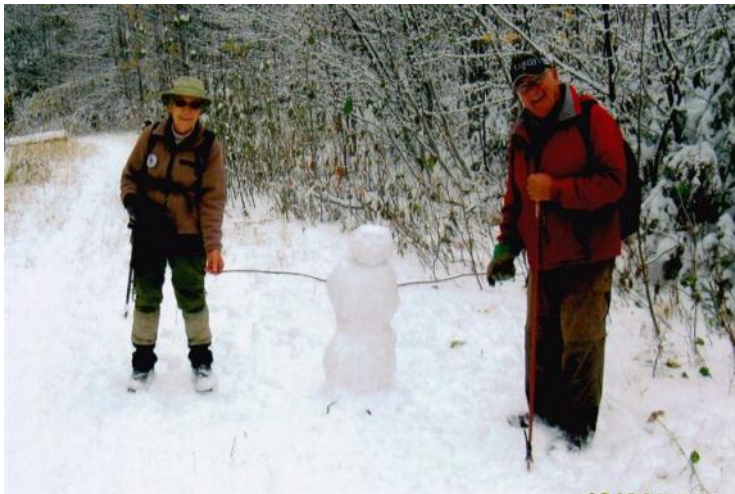
Central Okanagan Naturalists hike