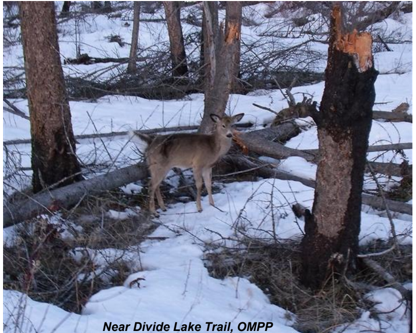
Near Divide Lake Trail, OMPP

2013 also marks the tenth anniversary of the Okanagan Mountain Provincial Park forest fire which started on Aug. 16, 2003 with a lightening strike in the park near Rattlesnake Island. The wildfire ravaged much of the park before it burned south and eastwards through residential neighbourhoods, Crown land, Myra-Bellevue Provincial park and the Myra Canyon trestles.