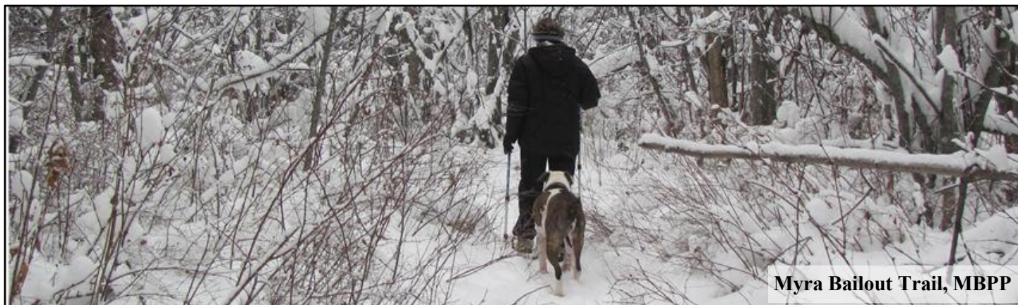
Myra Bailout Trail, MBPP