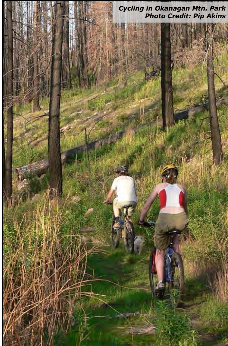
Friends of the South Slopes Newsletter Summer 2011