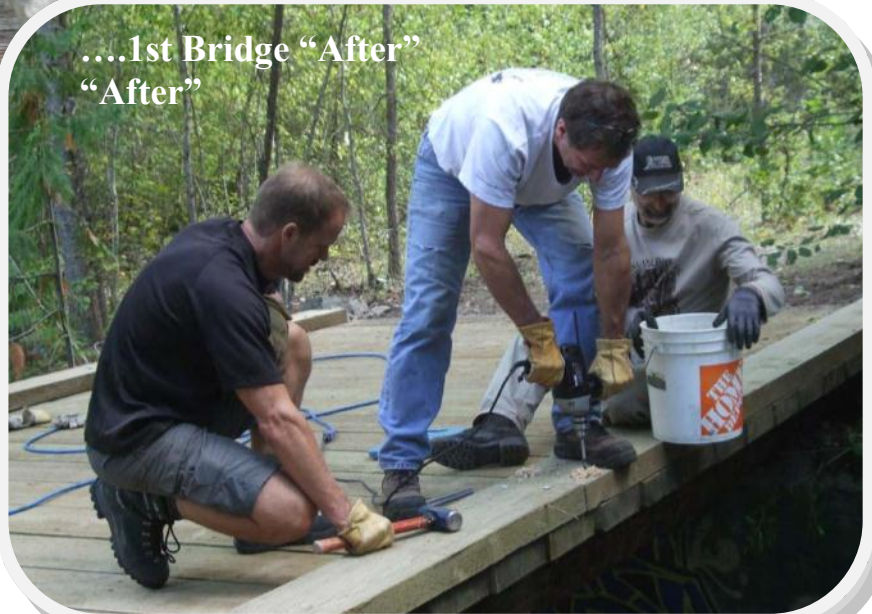
....1st Bridge "After" "After"