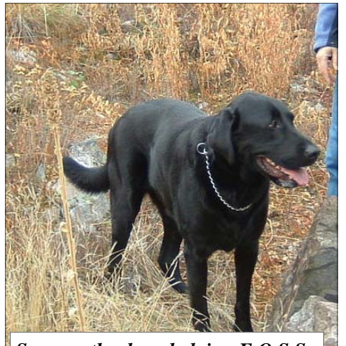
Spencer the dog, helping F.O.S.S. volunteers to install trail signs!

that we can continue to enjoy Myra-Bellevue P.P. with our dogs! "Leave No Trace" recreation applies to man's best friend too!