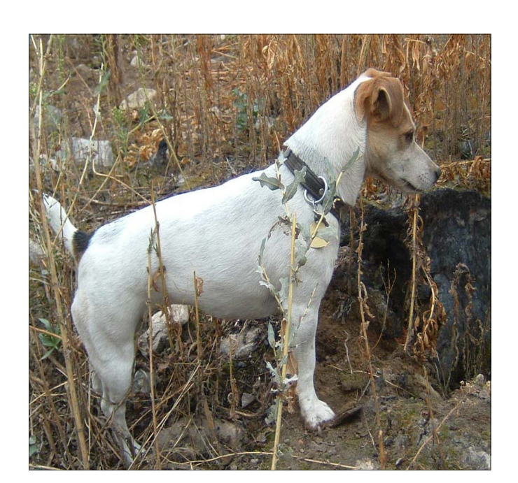
Trixie- one of MBPP's regular canine visitors