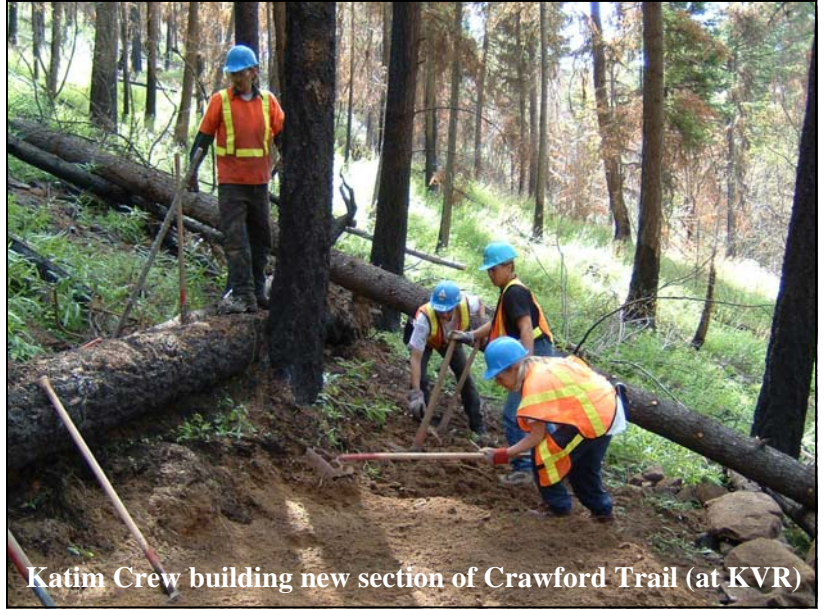
Kafim Crew building new section of Crawford Trail (at KVR)