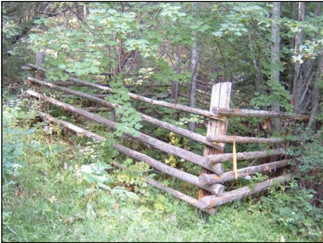
Spring on south end of Lost Lake Trail