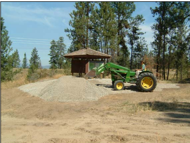
Volunteer spreading gravel at kiosk