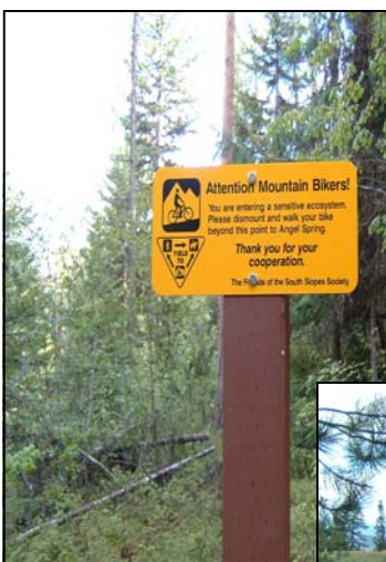
← Sign posted at entrance to Angel Spring canyon