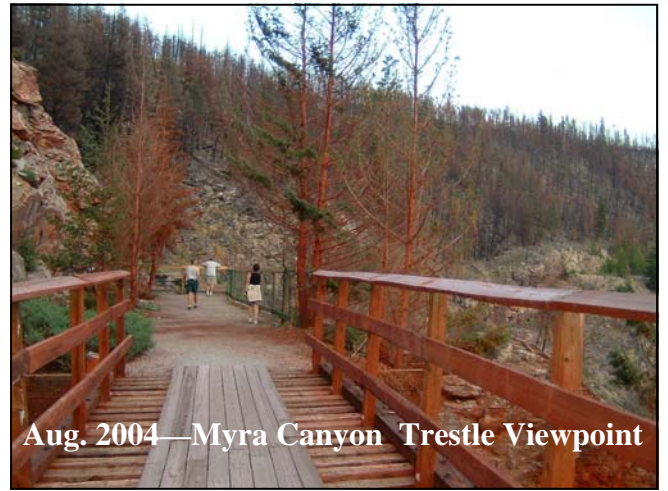
Aug. 2004—Myra Canyon Trestle Viewpoint