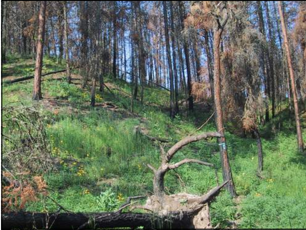
June, 2004—Re-growth