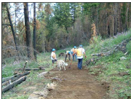
← August 2004 The Katim work crew at work rebuilding Lost Lake Trail