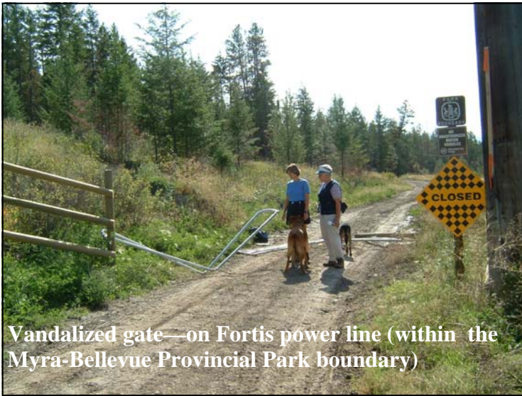
Vandalized gate—on Fortis power line (within the Myra-Bellevue Provincial Park boundary)