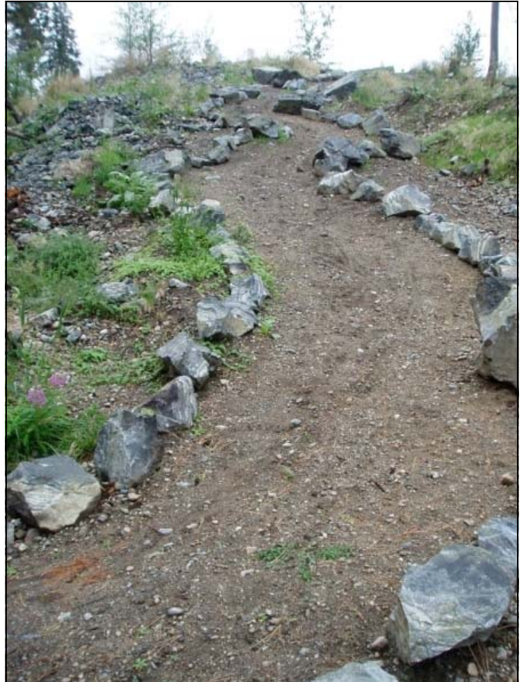
New trail in Crawford Estates area, connecting Stewart Road West to Myra- Bellevue Provincial Park