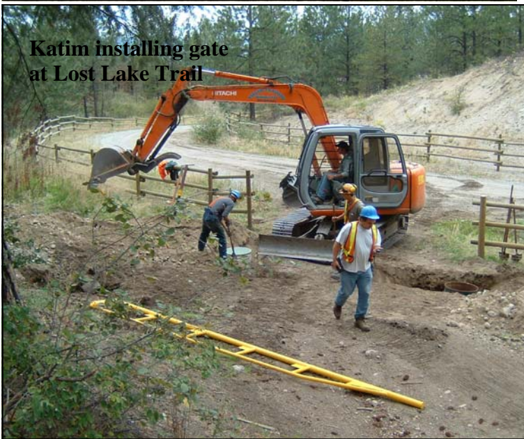
Katim installing gate at Lost Lake Trail