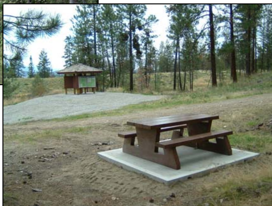
Picnic Table at Stewart Rd. East Trailhead →