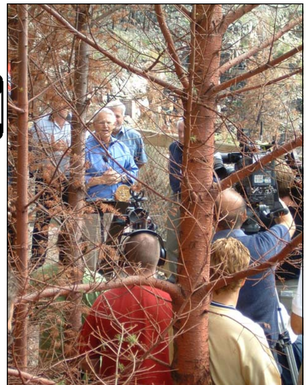
Aug. 26 2004—Premier Gordon Campbell - Funding announcement to re-build trestles