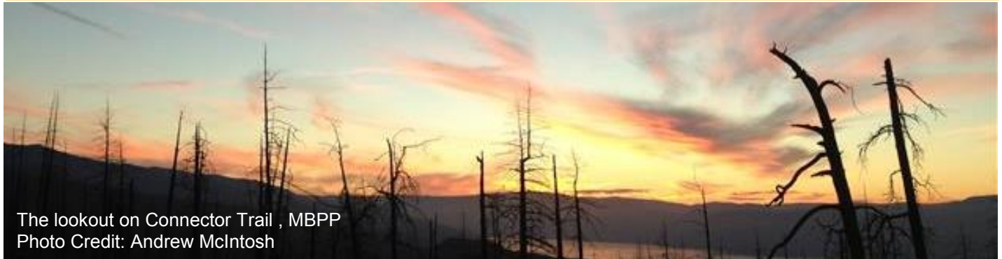
The lookout on Connector Trail , MBPP

Box 28011 RPO East Kelowna Kelowna BC V1W 4A6