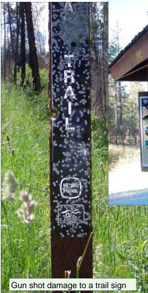
Gun shot damage to a trail sign

On the night of Thursday September 13, 2007 the Stewart Road East trailhead was targeted. The pit toilet, concrete parking barriers and signs were 'tagged'. The most serious damage was done at the information kiosk. Cleanup and repairs were undertaken by BC Parks' staff.