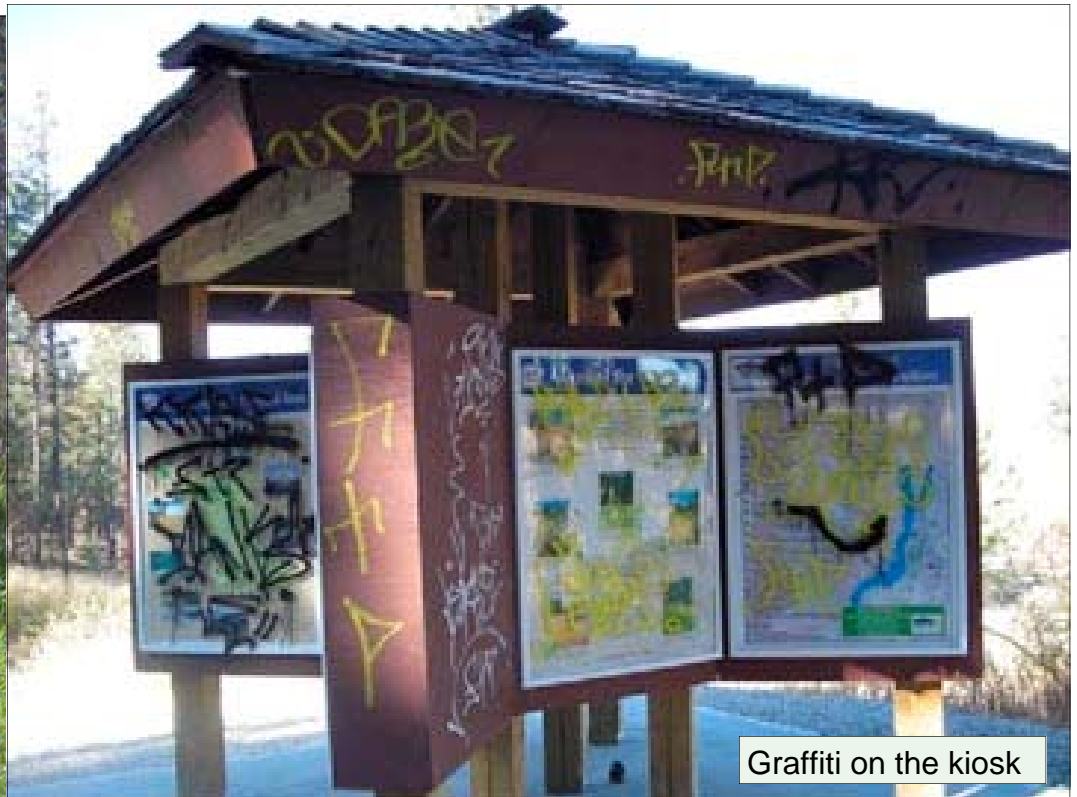
Graffiti on the kiosk