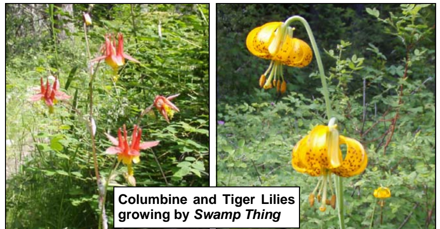
Columbine and Tiger Lilies growing by Swamp Thing