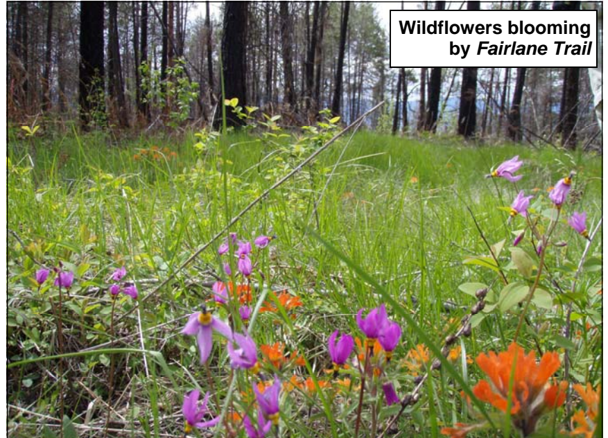
Wildflowers blooming by Fairlane Trail