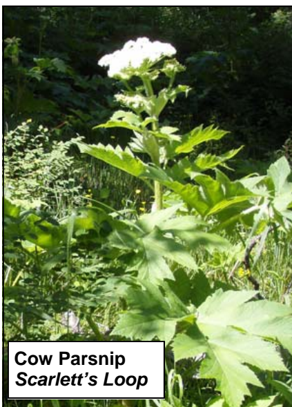
Cow Parsnip Scarlett's Loop