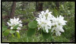
Mock Orange-Harvard Road Right of Way (Salamander Trail)