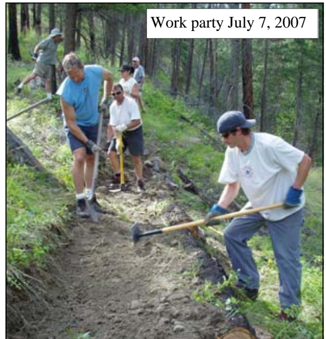
Work party July 7, 2007