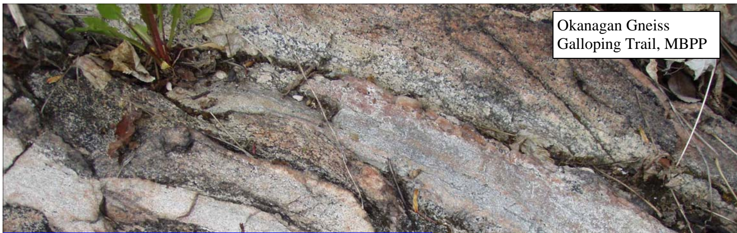
Okanagan Gneiss Galloping Trail, MBPP