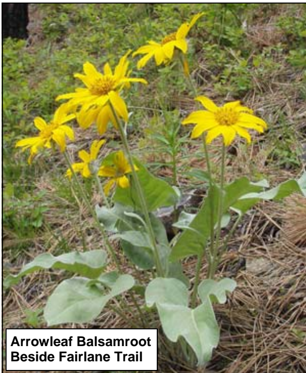
Arrowleaf Balsamroot Beside Fairlane Trail