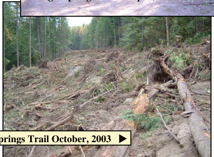
Angel Springs Trail October, 2003 ▶