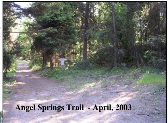
Angel Springs Trail - April, 2003