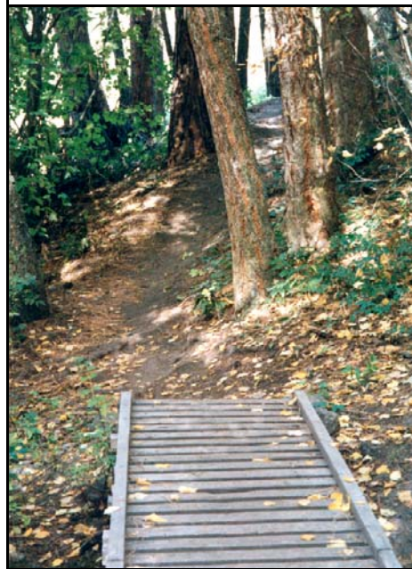
Bridge over Hachey Creek Oct. 02

or any other authorized volunteer group is working within the park, they will be identified as "authorized volunteers".