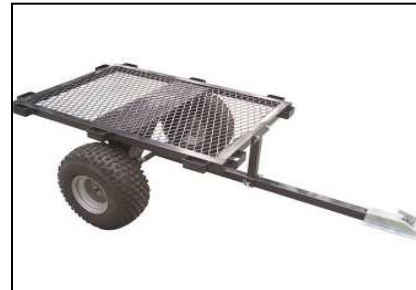
UTV Trailer – Connects to UTV to allow for transportation of various tools and equipment.