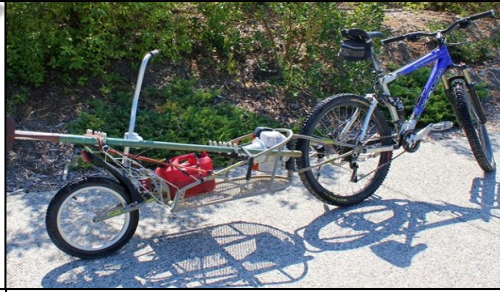
Mountain Bike & Trailer – For hauling tools and supplies. Will carry the Power Brusher, Shovels etc.