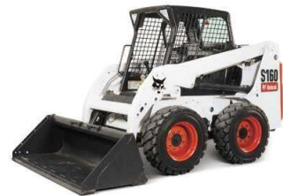
Skid-Steer Loader (Bobcat) – Used for projects requiring large amounts of material placement. Rented as required for each project. Experienced operator required.