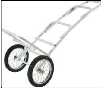
Trail Cart – For hauling tools & supplies.