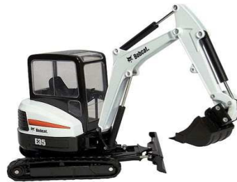
Excavator – Used for projects requiring large amounts of material placement. Rented as required for each project. Experienced operator required.