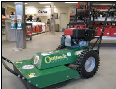
Brush Mower – For cutting of brush as required. Download & read manual before use. A signed “Brush Cutter Consent Form” is required.