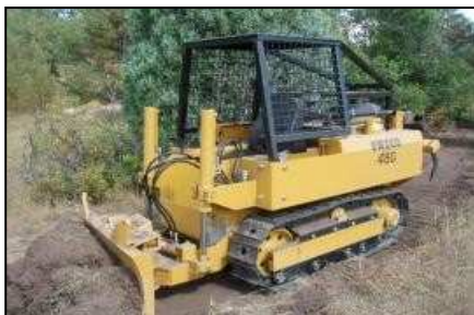
Sweco Bulldozer – Used for the rebuilding of double track trails. This machine is hired on a contract basis with an operator.