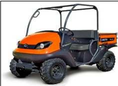
UTV – For transporting up to 2 people with tools and supplies. UTV users must have completed a FOSS approved operators program. Contact FOSS if you would like to attend an approved UTV operator program.